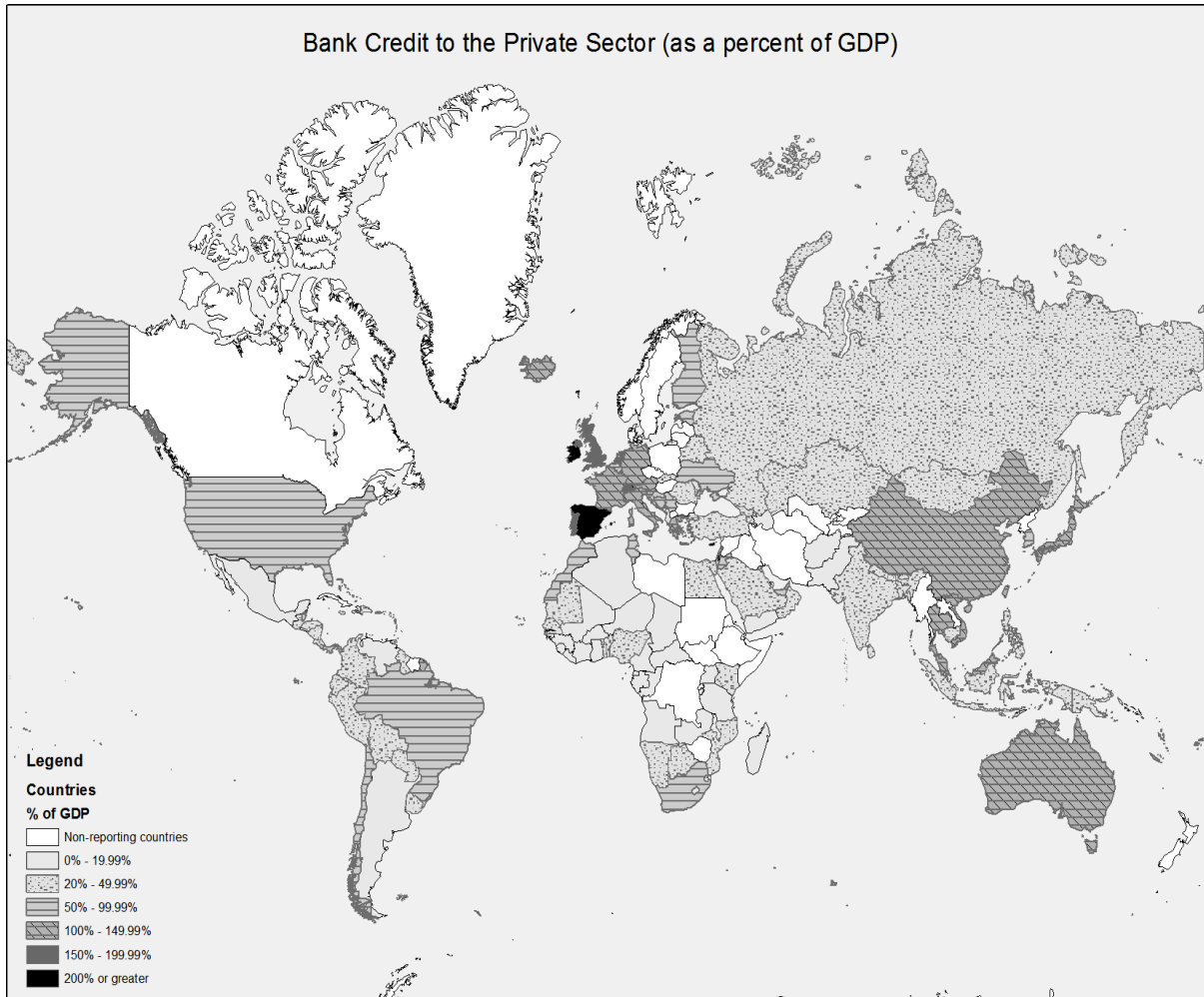
Figure 1. Financial Depth Around the World